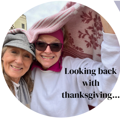
Looking back with thanksgiving...